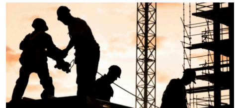
Page 15 National Construction Day