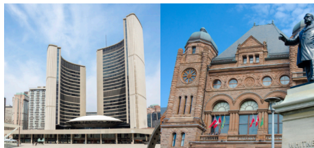
Page 14 New Deal for Toronto