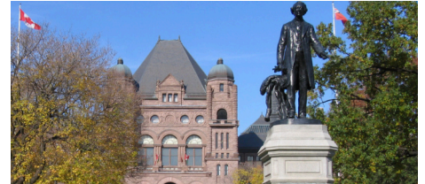
Pages 10-12 Fall Economic Statement