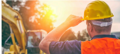
Pages 4-9 Members Corner