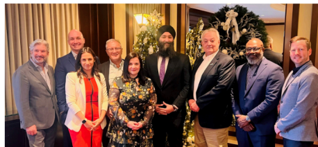
Page 22 Season's Greetings