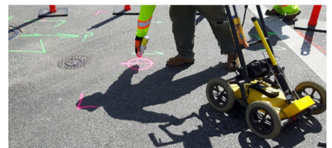
Page 21 Utility Locates