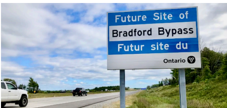
Page 13 Infrastructure Ontario Market Update & Bradford Bypass