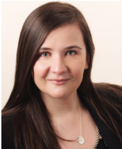
Page 3 Executive Director's Message