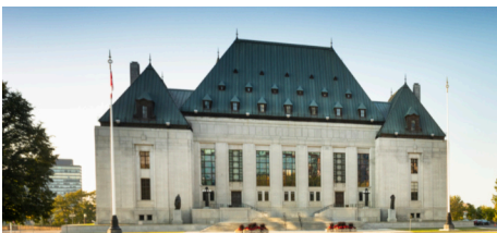
Page 16 Highway 413